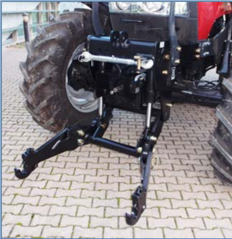
ST3.8 on MAXXUM 125

LAFORGE offers basic and economic front hitches, compatible with front loaders*.