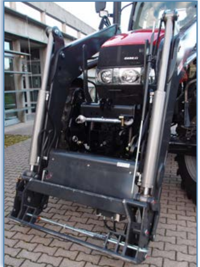
ST3.8 on MAXXUM 125 with loader

Ground clearance and manoeuverability are fully retained.