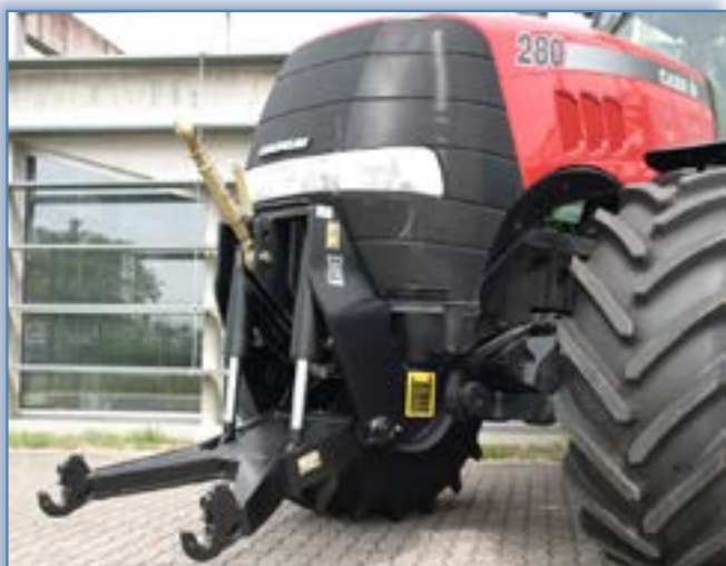
HDI on CASE IH MAGNUM 280