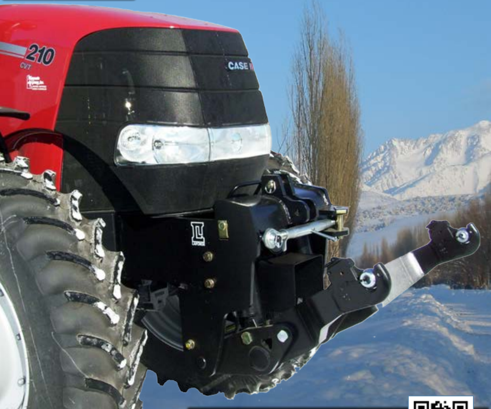
PHOTO : ST5 WITH FRONT PTO

FARMALL - MAXXUM - MXU - PUMA - MXM - CVX - MAGNUM