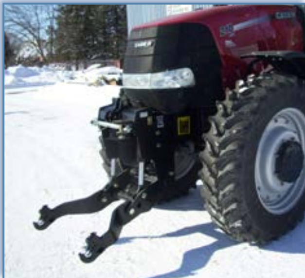
ST5 on PUMA 210

LAFORGE offers front hitches with advanced features and higher lift capacity