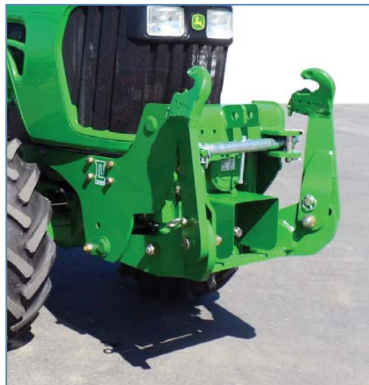
Front hitch GreenLink® ST3/5E

■ Ground clearance and manoeuverability are fully retained.