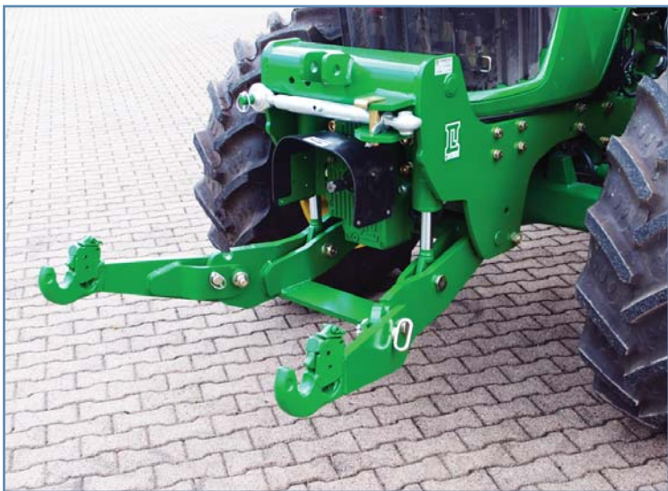
Front hitch GreenLink® ST3/5M

The unique experience from LAFORGE and a close collaboration with John Deere has allowed LAFORGE to create the GreenLink® ST3/5M front hitch and the GreenLink® ST3/5E front hitch to optimize tractor performance from John Deere 5M and 5E tractors.